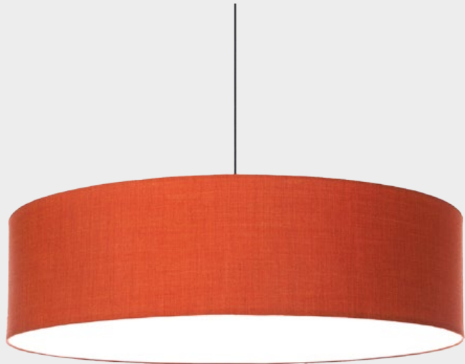
REMIX 2 - 543