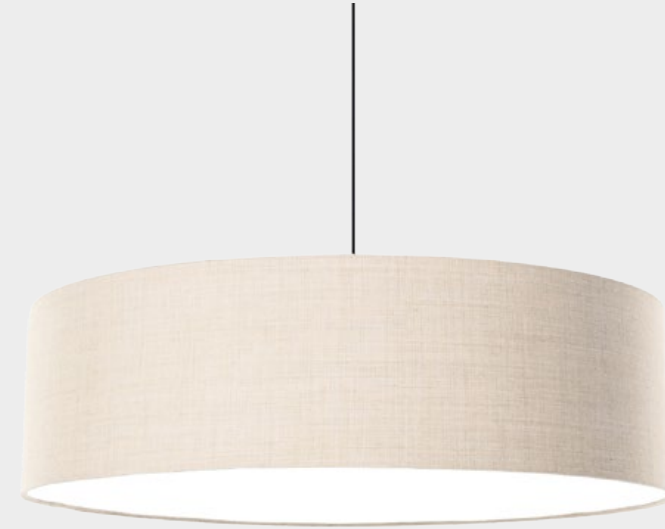
REMIX 2 - 113