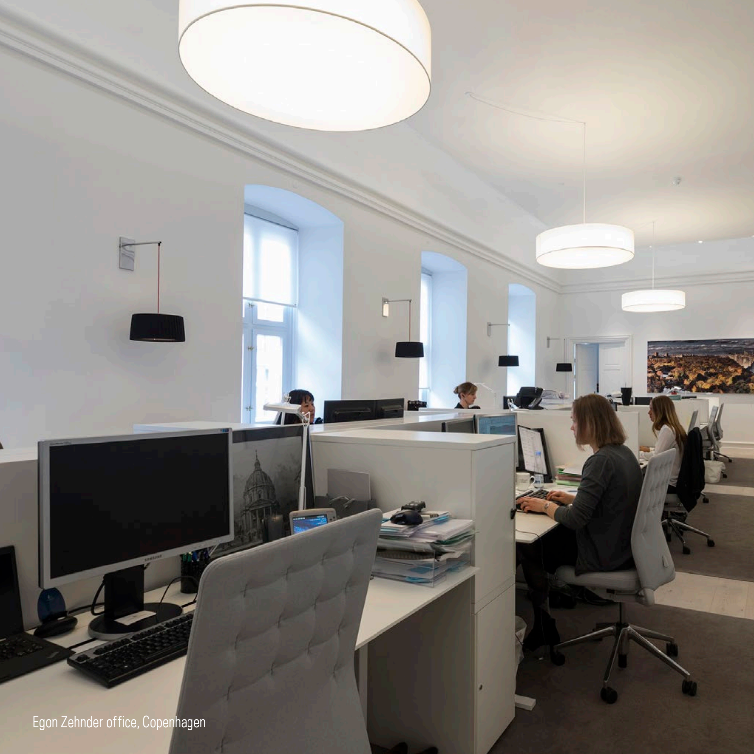
Egon Zehnder office, Copenhagen