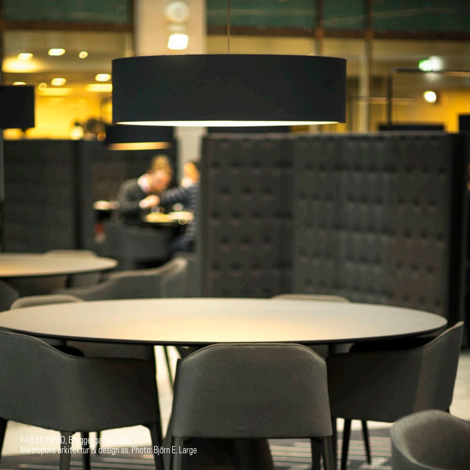
FAB 80, NPRO, Bryggergaten, Oslo Metropolis arkitektur & design as.