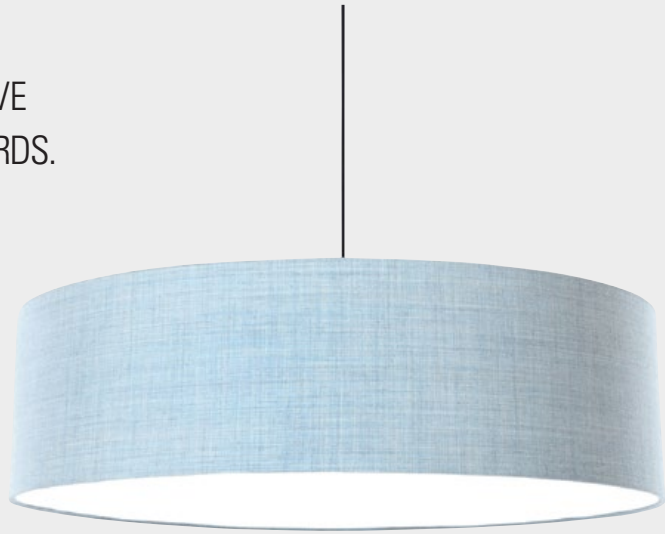
REMIX 2 - 823

TO SIMPLIFY, WE HAVE CHOOSEN 4 STANDARDS.