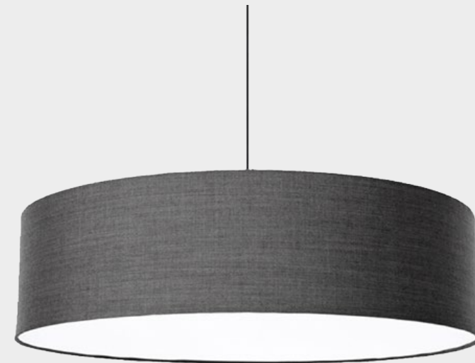
REMIX 2 - 152